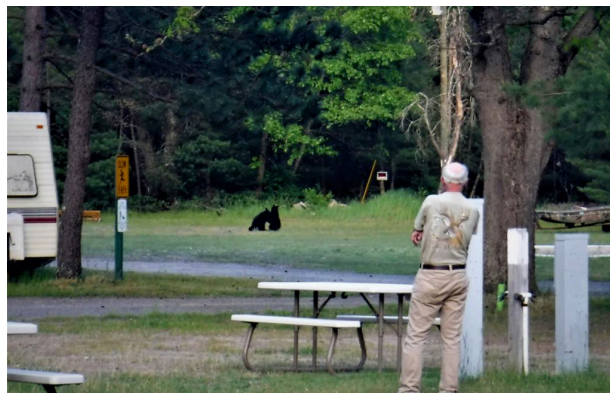
Lynn took this picture of one of the interesting events at Whispering Oaks

https://www.michigancampground.com/index.html