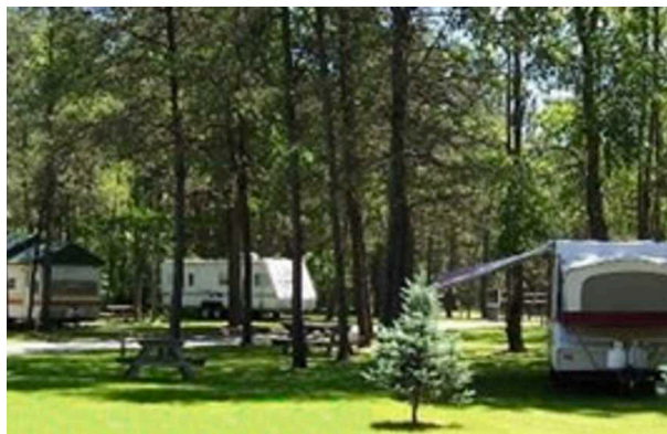
Full Service RV sites are available. Tent sites are also available.

A typical cabin at Whispering Oaks. The cabins are really nice, sleeps up to four and includes a fire ring, picnic table, covered porch, cable TV, and also a mini-refrigerator, microwave and coffee maker. The super clean bath house/rest rooms are less than a minute away. It includes a dish washing facility and coin laundry.