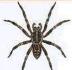
WOLF SPIDER NON AGGRESSIVE GROUND DWELLING

WARNING: MOST OF THESE SPIDERS CAN BE DANGEROUS TO PEOPLE WITH ALLERGIES OR HYPER SENSITIVITIES