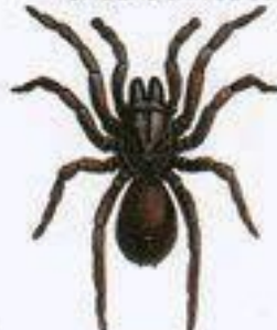
FEMALE TRAP-DOOR MILDLY TOXIC • NON AGGRESSIVE GROUND DWELLING (BURROW - OFTEN WITHOUT A LID)

SPIDERS CAN BE BENEFICIAL IN THE CONTROL OF MOSQUITOES & FLIES • BUT IF THEY PRESENT A DANGER - CALL FUMAPEST