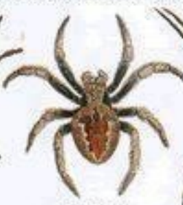
GARDEN ORB-WEAVING RELATIVELY HARMLESS • BENEFICIAL OFTEN SEEN IN A LARGE WEB IN THE GARDEN