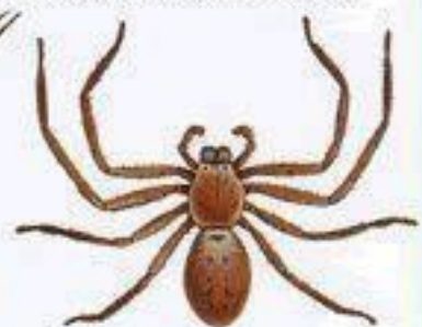
HUNTSMAN TIMID • RARELY BITES FOUND UNDER LOOSE BARK MAY WANDER INDOORS