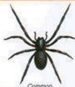
Common BLACK HOUSE SPIDER VENOMOUS • NAUSEA, SWEATING, ETC. OFTEN FOUND IN THEIR WEBS IN WINDOW FRAMES, EAVES, ETC.