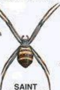
SAINT ANDREW'S CROSS