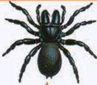
FEMALE MOUSE SPIDER ENLARGED HEAD & FANGS • DEEP PAINFUL BITE GROUND DWELLING - OFTEN MISTAKEN FOR FUNNEL-WEB