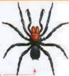
MALE MOUSE SPIDER