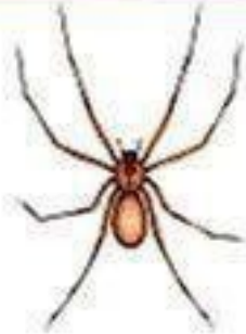
BROWN RECLUSE SPIDER