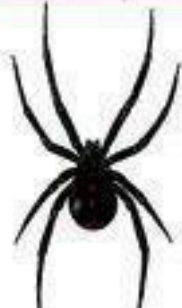
BLACK WIDOW SPIDER