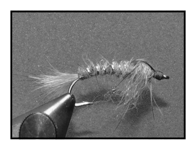
Step 4: Bring the wing case forward over the top of the thorax and tie off. Whip finish and cement. Then pick out the Hare's ear fibers of the thorax to form legs on bottom side of thorax.