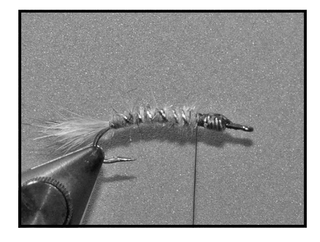
Step 2: Tie in some long face hairs from a Hare's mask for a tail. Tie in the Tinsel just in front of the tail. Dub the thread with Hare's mask and wrap forwardto just behind the lead.