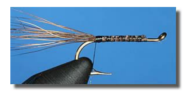
Step 1: Start thread on front of hook, wrap back to bend, and then forward to about 1/4 shank length back from eye. Tie on moose mane wrapping along the shank to where the wing will be. The tail is about 1 and 1/4 shank lengths long. Then bring the thread back to the bend.