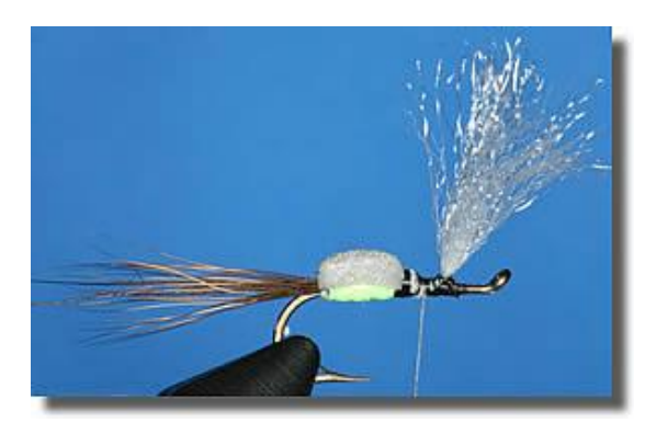
Step 5: Tie Zelon across hook shank wrapping lightly a couple of times. Figure-eight it tighter a couple of times. Post each wing (wrap up and down each wing a couple of times). Wrap around the wings to stand them up and separate them the right degree.