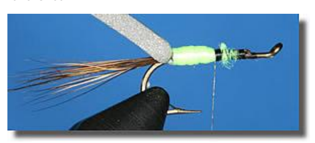
Step 3: Tie Uni-Stretch at front of foam. Wrap it back to the bend and then forward to tie in point. Make sure everything is covered. Wrap the Uni-Stretch tightly. Pull on it a little bit before you trim so it will snap back leaving no loose ends. Leave thread at front of floss.