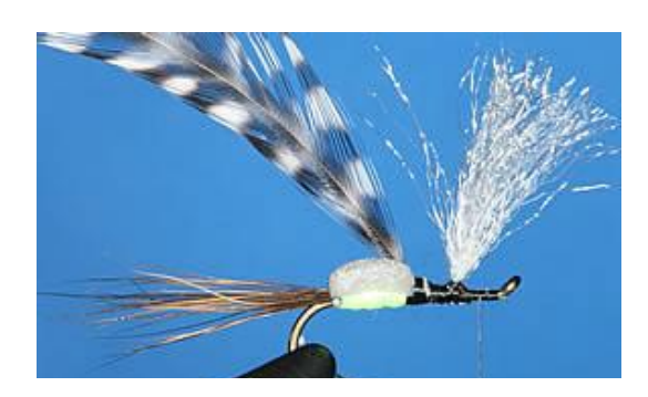
Step 6 : Select a hackle with barbs (fibers) that are about 1-1/2 gap widths long, and tie it on in front of foam. Make sure to leave bare quill above the thread as you tie in hackle. Make 4- 6 wraps behind the wings and the 2 to 4 in front. Tie off hackle securely.