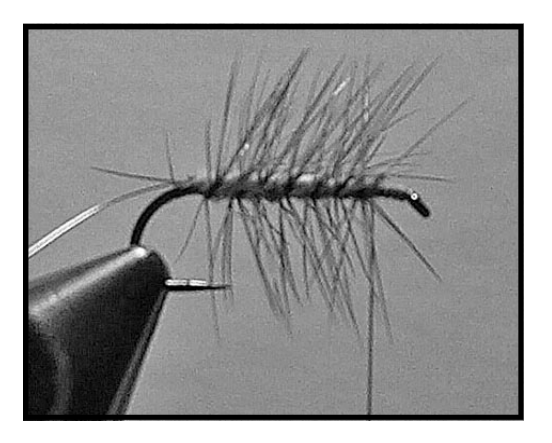
Step 2: Add dubbing to the thread and wrap forward to about 1/8" to 1/16th" behind the eye depending on the hook size. The palmer the hackle forward and tie off.