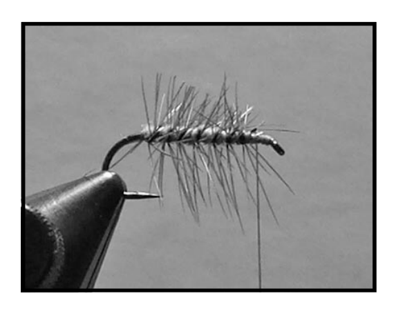
Step 3: trim the hackle at an angle to match the angle of the wing, then counter wrap the wire through the hackle and tie off.