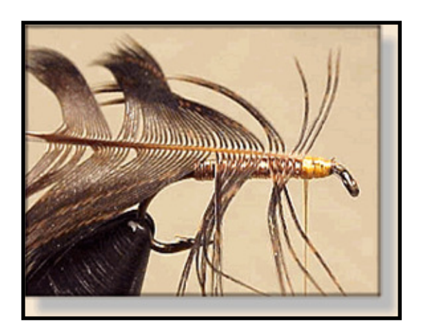
Step 3: Prepare a Partridge feather to tie in by the tip. After securing the hackle take two turn of hackle to form the soft hackle collar. It helps to use the fingers of your left hand to fold the hackle back as you wrap it.