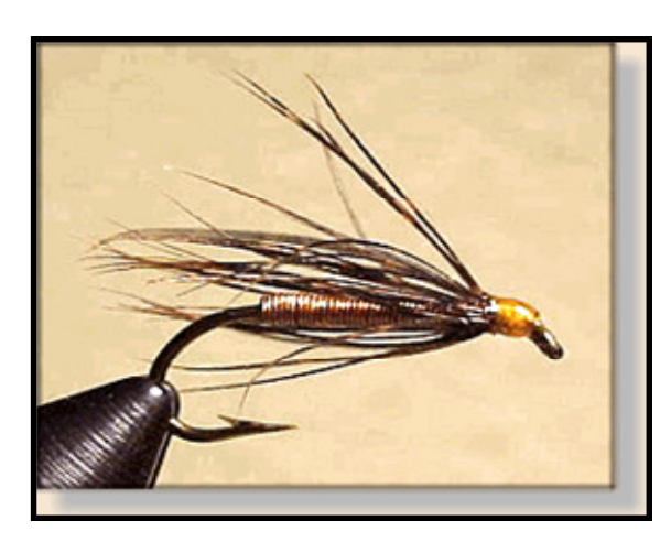
Step 4: Tie off the hackle and trim excess. Form a small thread head and wrap it back to hold the hackle at the desired angle.