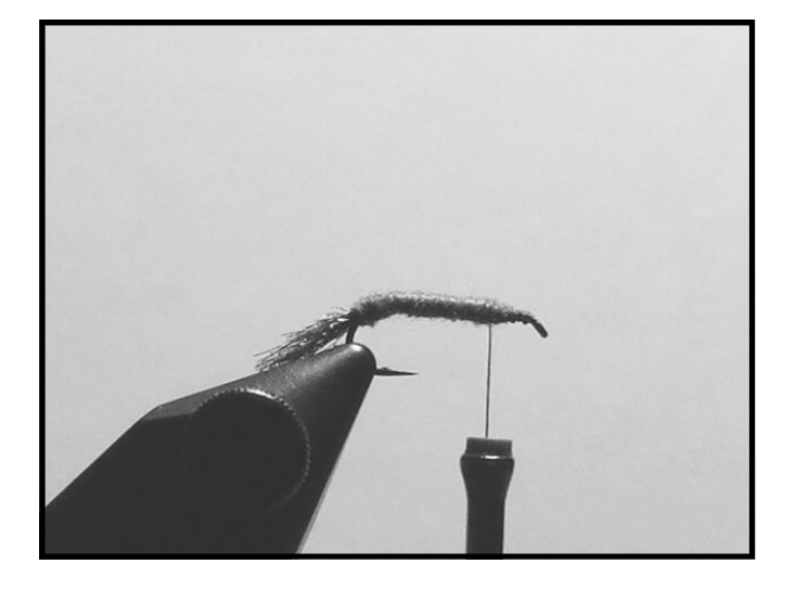
Step 2: Using fine dubbing, wrap the body up to a point behind the eye of the hook. You can vary the diameter of the body but in general this is a fairly small diameter imitation.