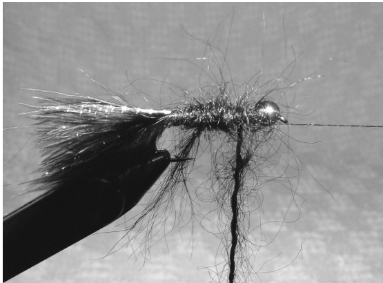
3. Tie in the end of the mohair yarn and wrap the body forward. As you get to the bead use your thumbnail to push yarn into the hole of the bead to keep it from slipping back the hook.