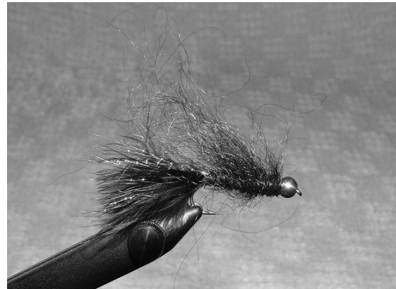
4. Whip finish behind the head. Then using a pop-sicle stick with a 3/4" length of the hook part of Velcro glued to one side, comb out the leech yarn or other body material in an up and back direction as shown. Think of the mane of a horse.