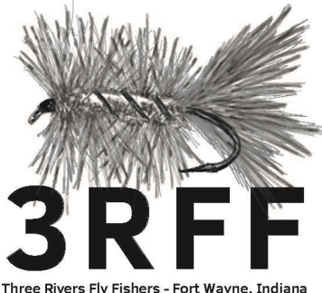
Fellowship • Education • Conservation